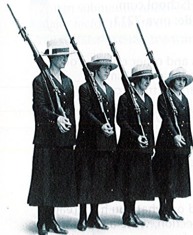
Women of the U.S. Navy drilling

After entering World War I, the United States quickly had to increase its military force.